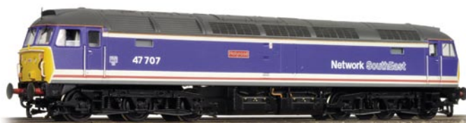
Brand new NSE Bachmann Class 47, 47 707 (31-654)

› A REAL ALE BAR and hot and cold refreshments will be available.